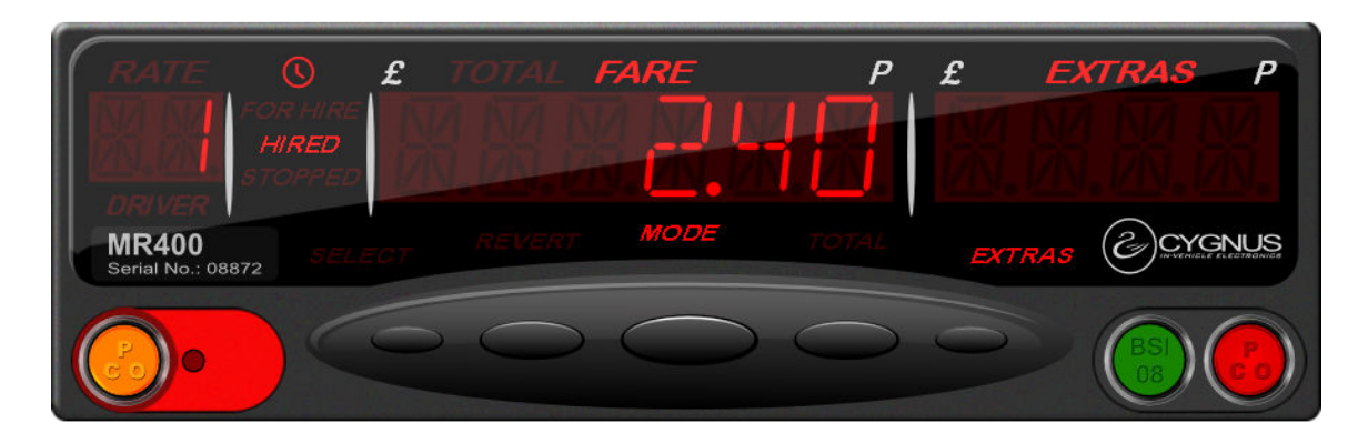
Figure 1 MR400 taximeter front view