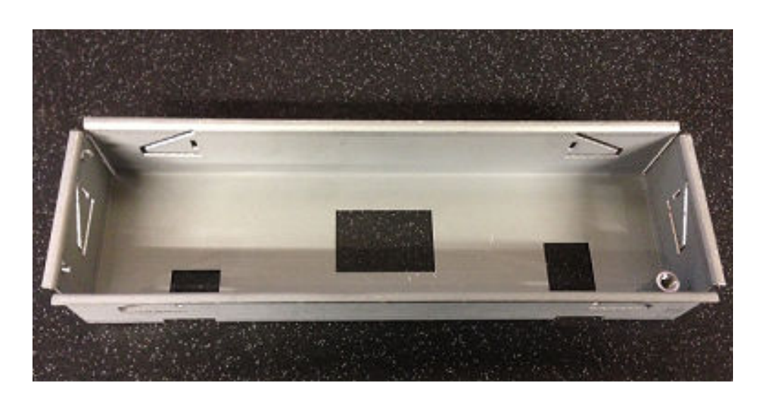
Figure 3 Installation bracket