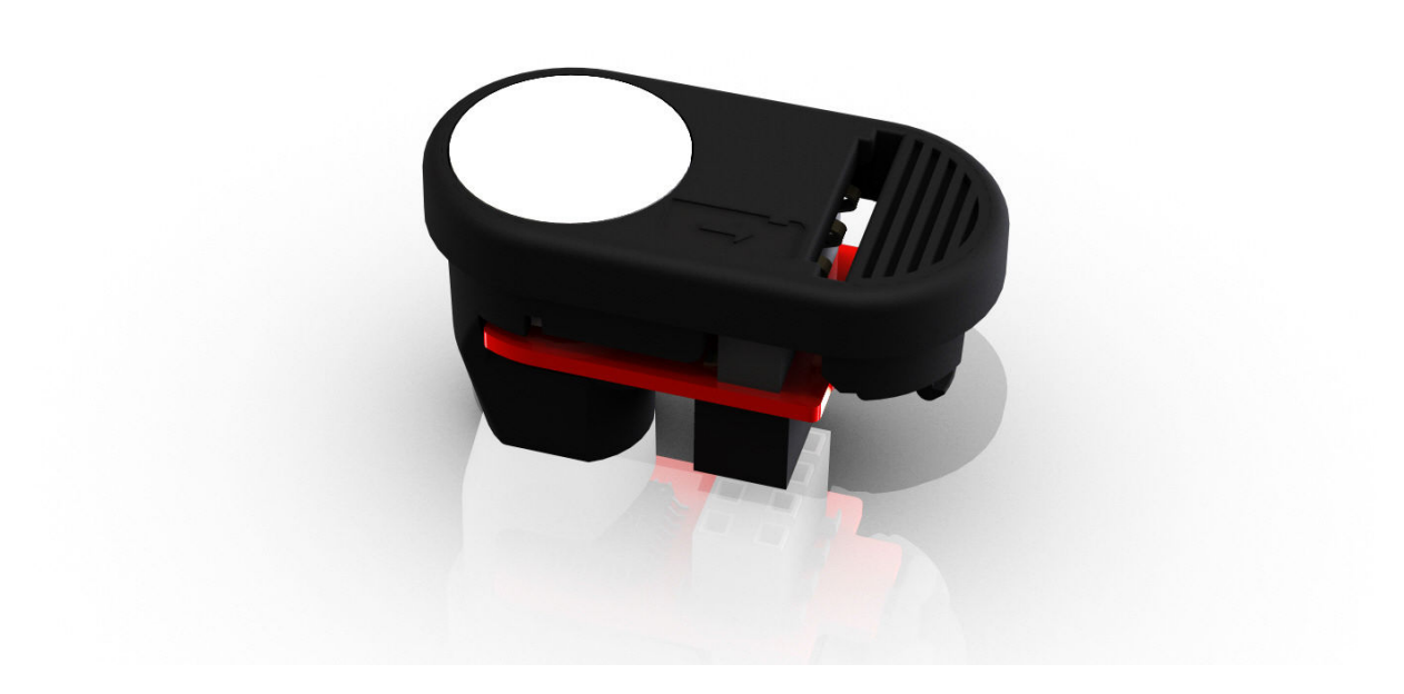
Figure 7 ST400 Secure Tariff Module

© Crown copyright 2015 National Measurement and Regulation Office Department for Business, Innovation & Skills This material may be freely reproduced except for sale