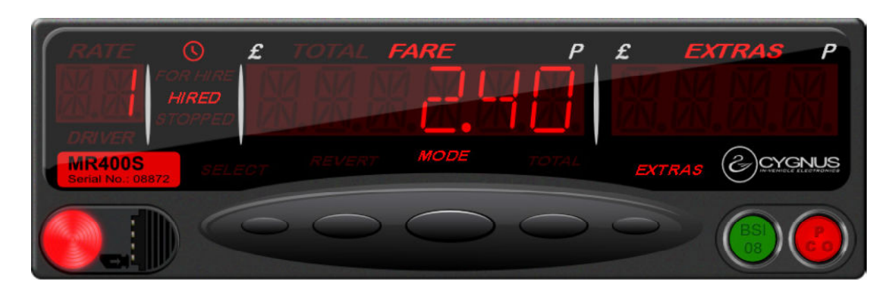
Figure 6 MR400S taximeter