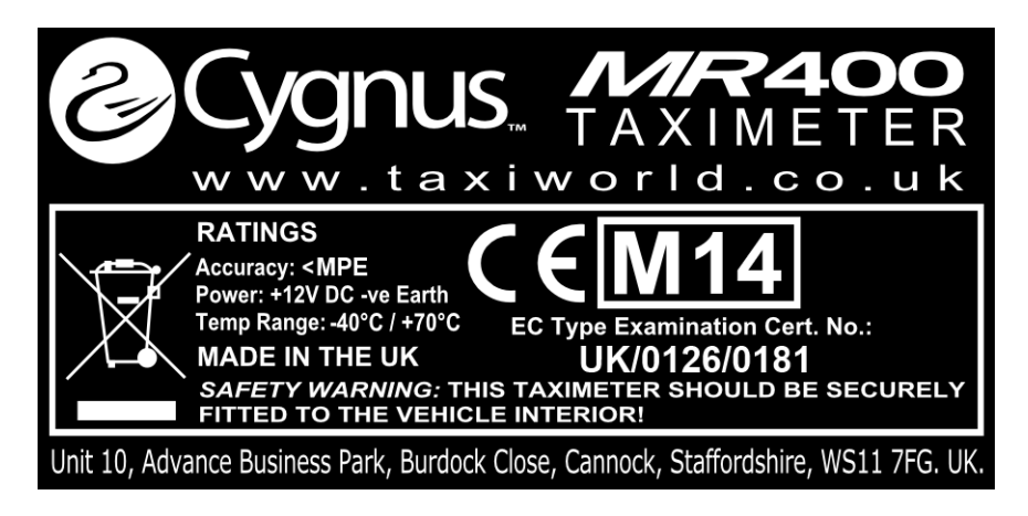
Figure 5 Markings (example)