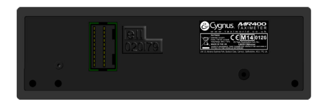
Figure 2 MR400 taximeter rear view